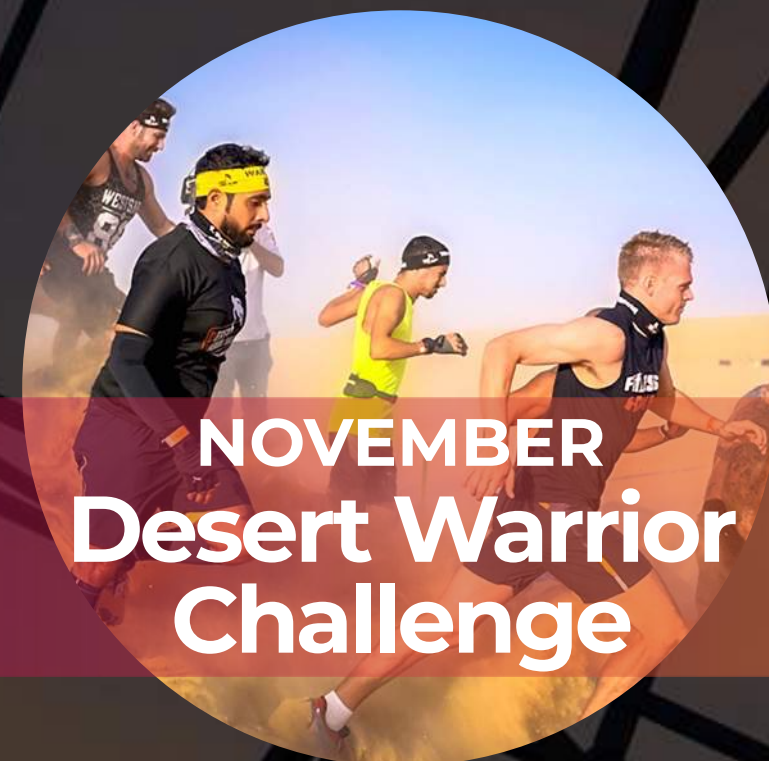
NOVEMBER Desert Warrior Challenge