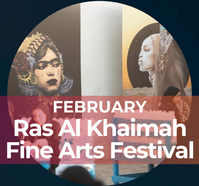
FEBRUARY Ras Al Khaimah Fine Arts Festival