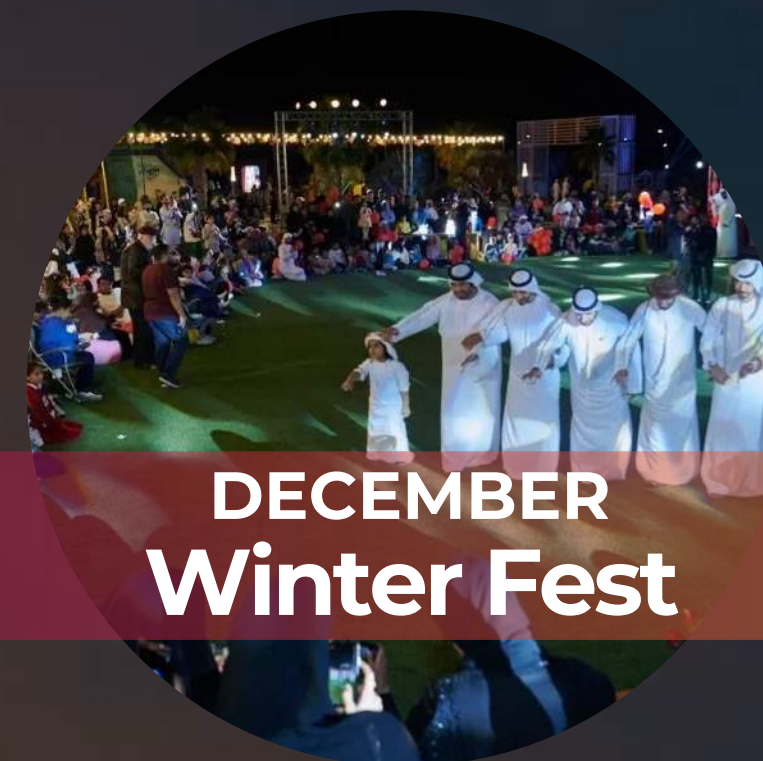
DECEMBER Winter Fest