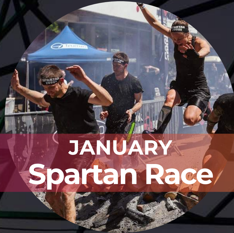
JANUARY Spartan Race