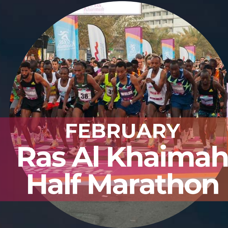
FEBRUARY Ras Al Khaimah Half Marathon