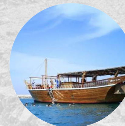
Miss Teak Dhow