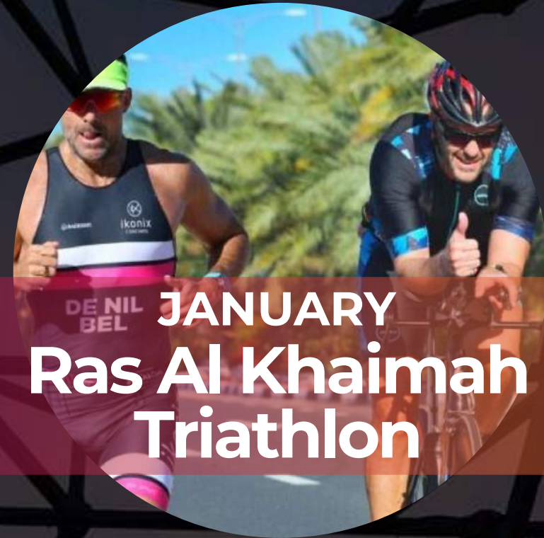
JANUARY Ras Al Khaimah Triathlon