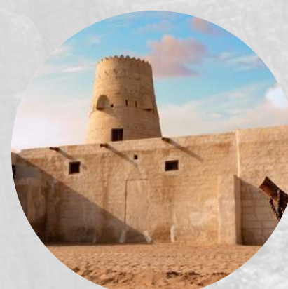
Jazeera Al Hamra