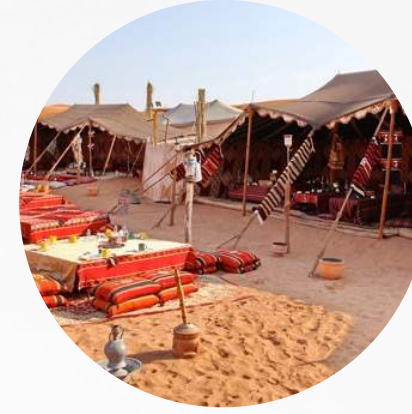
Bassata Desert Village