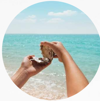
Suwaidi Pearls Farm