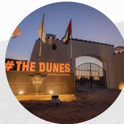
The Dunes Camping