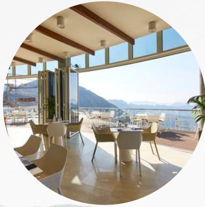
1484 by Puro