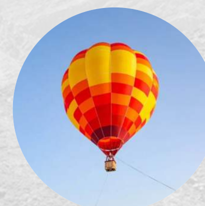
ActionFlight Hot Air Balloon Ride