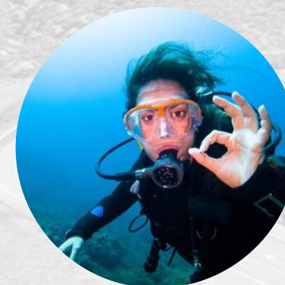
Al Jazeera Diving Centre