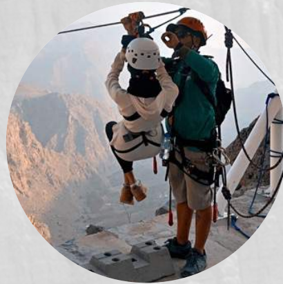
Jais Sky Tour