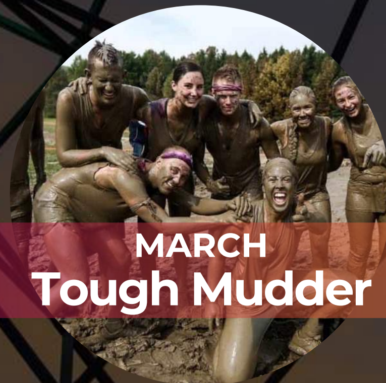
MARCH Tough Mudder