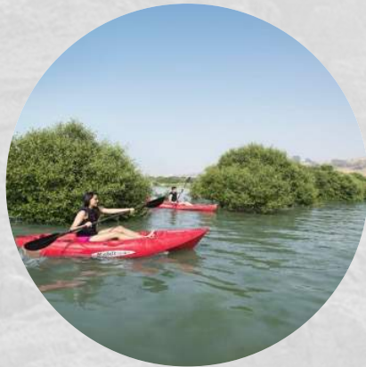
Challenging Adventure Kayaking