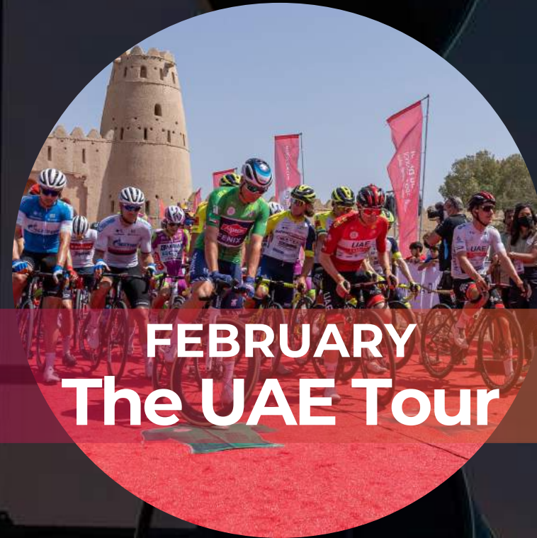
FEBRUARY The UAE Tour