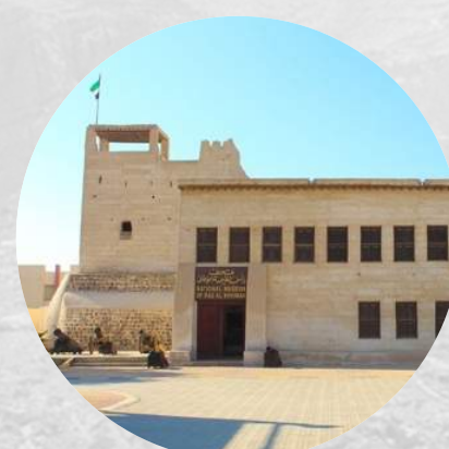
The National Museum