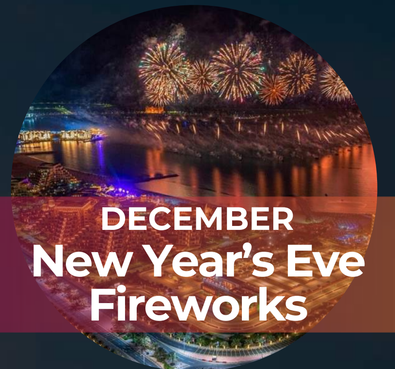
DECEMBER New Year's Eve Fireworks

For more information on the events taking place in Ras Al Khaimah, please visit rakcalendar.ae