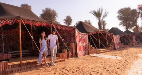
📍 Bassata Village Desert Camp