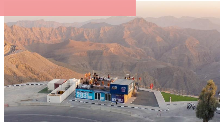
📍 Jais Rooftop Terrace