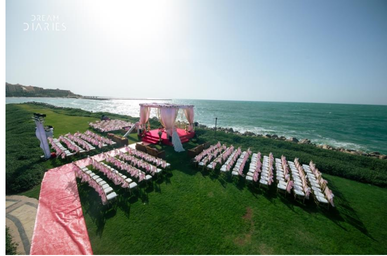
📍 Rixos Al Mairid Ras Al Khaimah

64 kms of pristine coastline surround Ras Al Khaimah with a lot of renowned 5 star hotel brands located along the beach