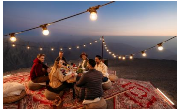
📍 Jais Picnic Peak