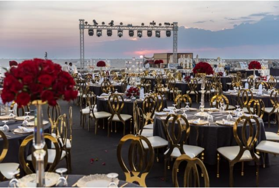
📍 Intercontinental Ras Al Khaimah