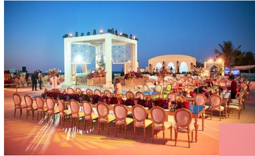
📍 Waldorf Astoria