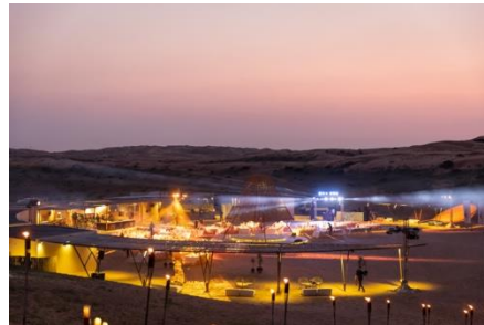
📍 Sonara Camp

Set in the desert dunes where you can experience both traditional and luxury camps & nearby archeological sites for bespoke event set-ups