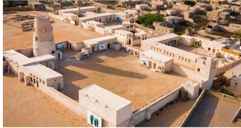
Al Jazeera Al Hamra

With over 7,000 years of recorded human history dating back to the Bronze Age, Ras Al Khaimah (meaning Top of the Tent) is steeped in rich Arabian culture and fascinating heritage