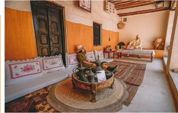
National Museum of Ras Al Khaimah

With over 7,000 years of recorded human history dating back to the Bronze Age, Ras Al Khaimah (meaning Top of the Tent) is steeped in rich Arabian culture and fascinating heritage