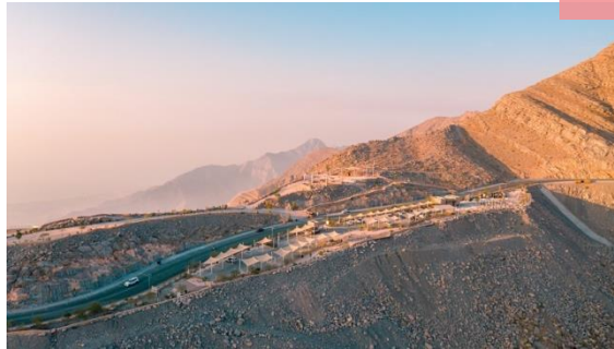
📍 Viewing Deck Park

From the highest restaurant and camp in the UAE to spectacular mountain spaces, Jebel Jais is a one-of-a-kind nature venue