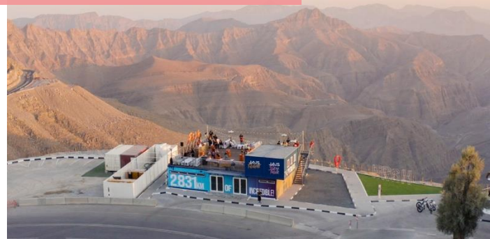
📍 Jais Rooftop Terrace