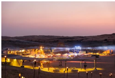
📍 Sonara Camp