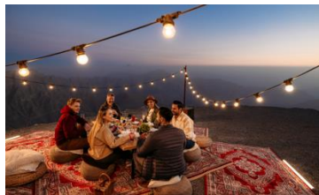
📍 Jais Picnic Peak