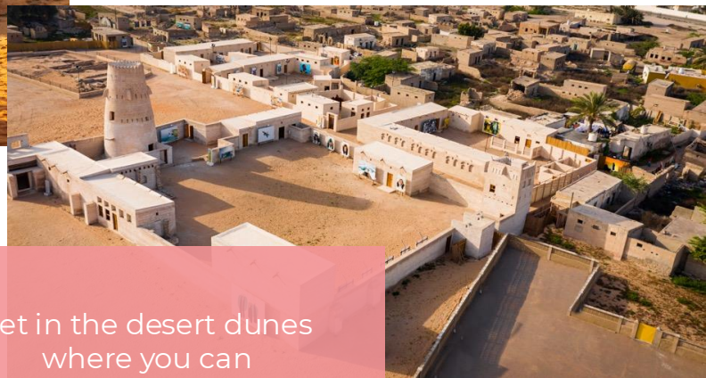
📍 Al Jazeera Al Hamra

Set in the desert dunes where you can experience both traditional and luxury camps & nearby archeological sites for bespoke event set-ups