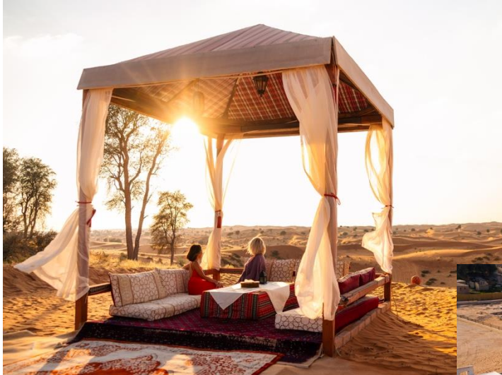
📍 Bedouin Oasis Desert Camp