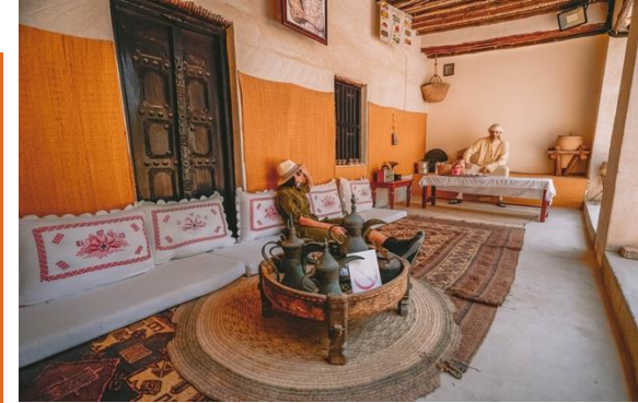
National Museum of Ras Al Khaimah

With over 7,000 years of recorded human history dating back to the Bronze Age, Ras Al Khaimah (meaning Top of the Tent) is steeped in rich Arabian culture and fascinating heritage