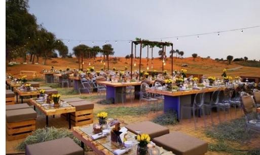
📍 Ritz Carlton Al Wadi Desert