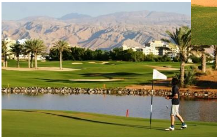
📍 Tower Links Golf Club