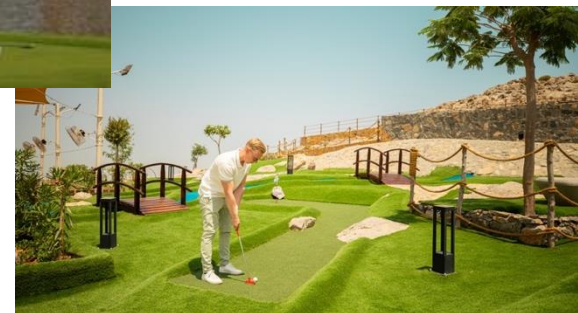
📍 Jais Mini Golf