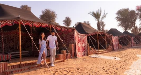
📍 Bassata Village Desert Camp