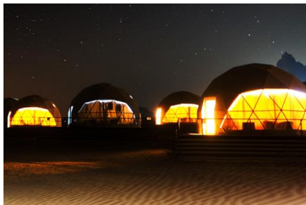
📍 The Dunes Camping & Safari