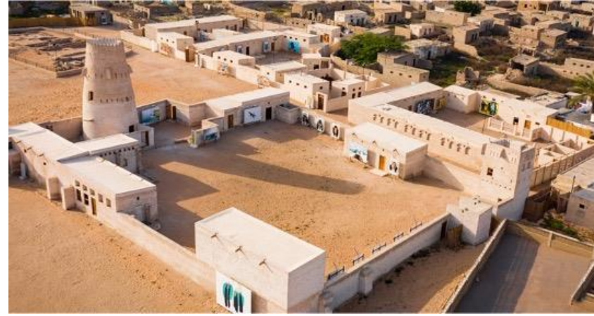
Al Jazeera Al Hamra

With over 7,000 years of recorded human history dating back to the Bronze Age, Ras Al Khaimah (meaning Top of the Tent) is steeped in rich Arabian culture and fascinating heritage