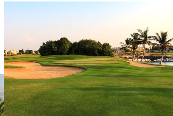
📍 Al Hamra Golf Club