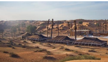
📍 Bassata Village Desert Camp