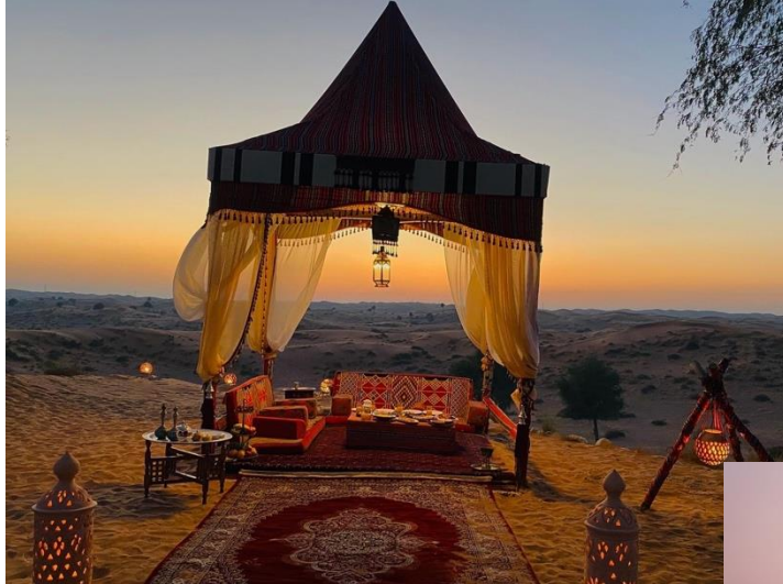
📍 Bedouin Oasis Desert Camp