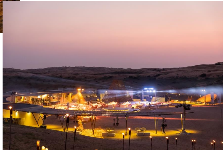
📍 Sonara Camp

Set in the desert dunes where you can experience both traditional and luxury camps & nearby archeological sites for bespoke event set-ups