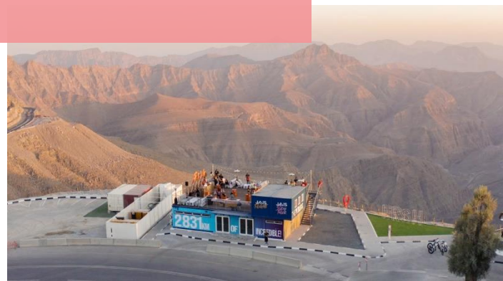
📍 Jais Rooftop Terrace