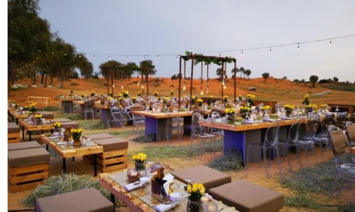
📍 Ritz Carlton Al Wadi Desert